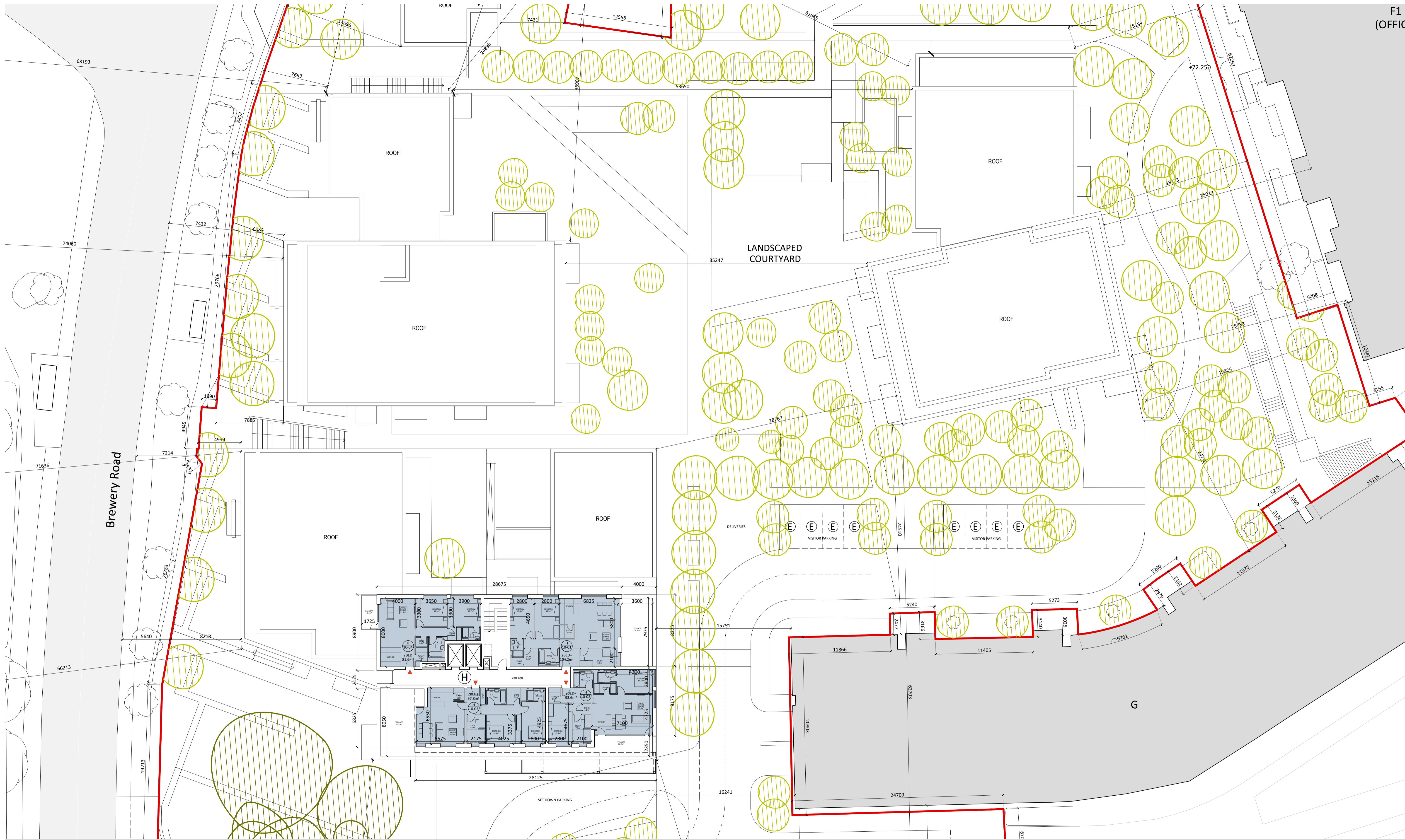
Blocks H, J & M Level 10 Plan